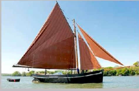
2 Hour River Cruises