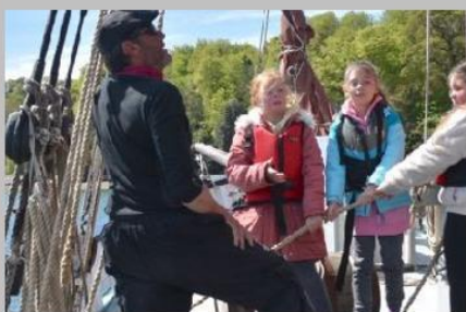
Traditional Skills - Hoisting Sails "Sweating & Tailing" and Crane Demonstrations